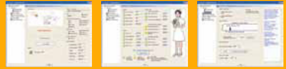
FULL STATUS MONITOR