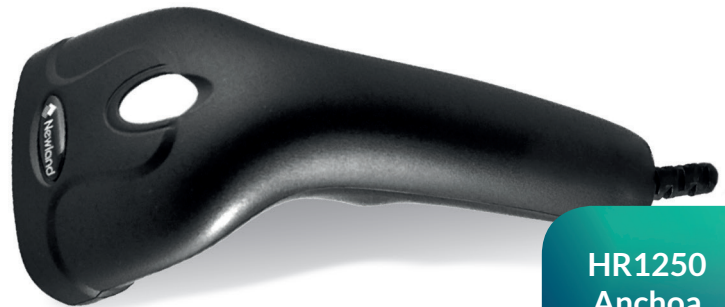
HR1250 Anchoa handheld barcode scanner