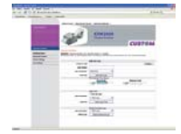
Font and Logo Updating