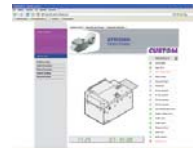
Real Time Status Monitor